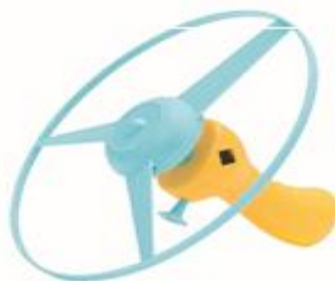
Zoom Flying Disk