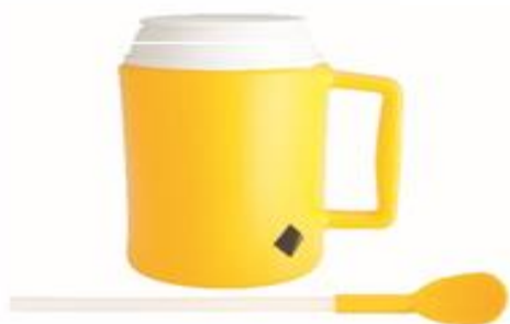
Slushie Maker Cup

The cut off for School Banking rewards will be Friday 30 November.