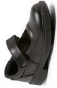
'CLARKS' RAPTURE SHOES