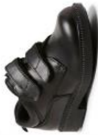
'CLARKS' RELIANCE VELCRO SHOES

Savings off original prices. While stocks last.