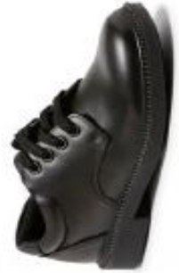
'CLARKS' REWARD LACE UP SHOES